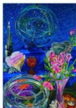
Strike Sparks Selected Poems, 1980-2002